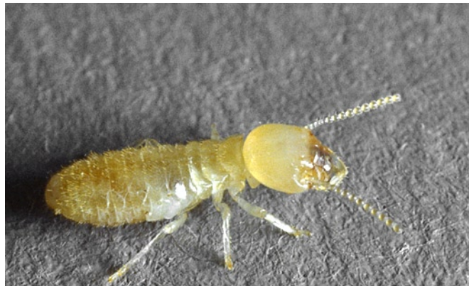
Figure 1. Subterranean termite, worker caste. About 1/5” long.

Moisture is vital to the survival of termites. They obtain most of their moisture from the soil and