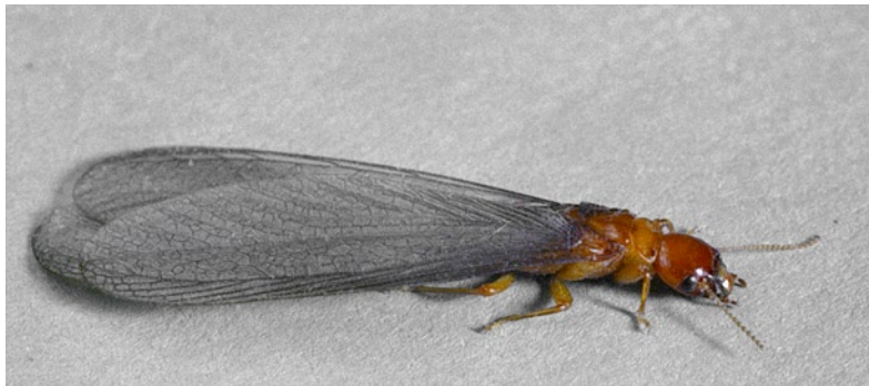
Figure 3. Dampwood termite. About 1" long. Note the delicate, net-veined wings.